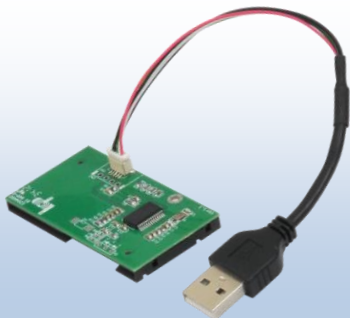
USB9540 (Smart Card Reader module) x1

As a New manufacturer of quality computer connectivity products since 2009/Mar, BPLUS technology brings to market a broad range of upgrade products. These products bridge the connection between Desktop/Notebook systems and external peripherals.